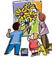
THANK YOU TO OUR CHURCH SCHOOL TEACHERS

We wish to thank all our new Church School teachers for helping provide a valuable ministry for our young children. We are also pleased to announce a return of Toddler-age Church School during the Celebrate! service.