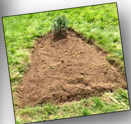
A trapezoid is a challenge to create!