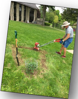
Don Crose in rototill action!