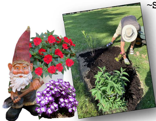
~Submitted by the Garden Gnome

The Garden Team wholeheartedly supports anyone wanting to do their stretch exercise goals by pulling out errant grass or pesky weeds in either the Butterfly or Community Garden. The pickings can be tossed in the “lawn pile” beyond the Middleton Memorial Fountain Garden or just leave on one of the pavers forming the cross, and a team member will take care of them.